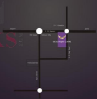
<N> LOCATION MAP

IREAL UNIQRE CENTRE has been developed and designed in a manner that will not only make it the talking point of the city but will also include a host of conveniences that will help improve the quality of work life. At the same time, being a Green building, it will play a pivotal role in serving its environmental commitments responsibly.